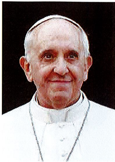
Pope Francis 1936-2025 Requiescat in Pace