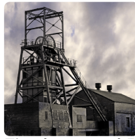
Firedamp and Davy Lamps