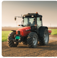
Sow, Grow and Farm