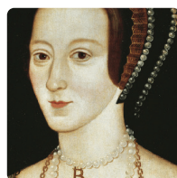
Off with Her Head!